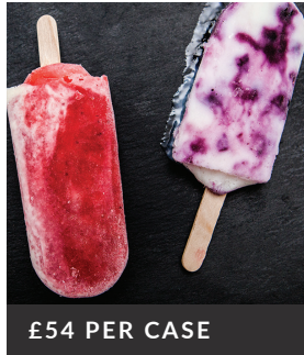
£54 PER CASE

Individual tubs with spoons under the lids 24 per case