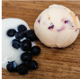
£18 PER TUB