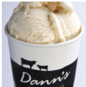
£36 PER CASE